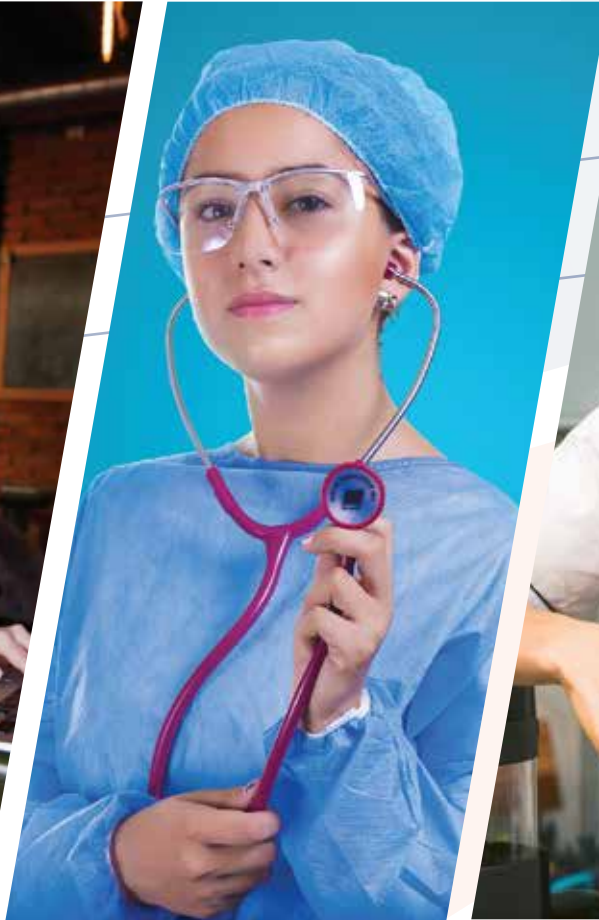
Health & Medical Care Industry