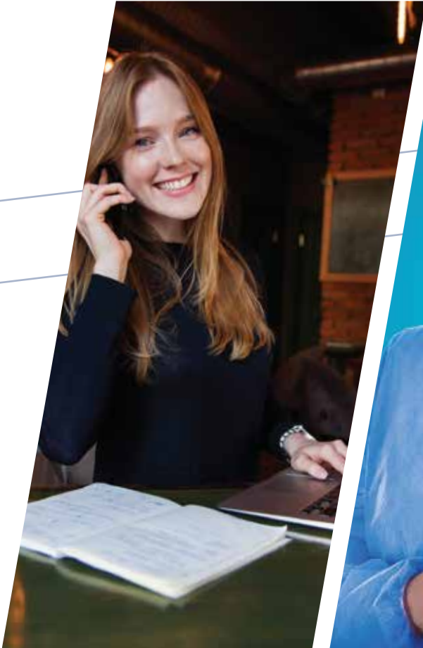
Banking and Finance Industry