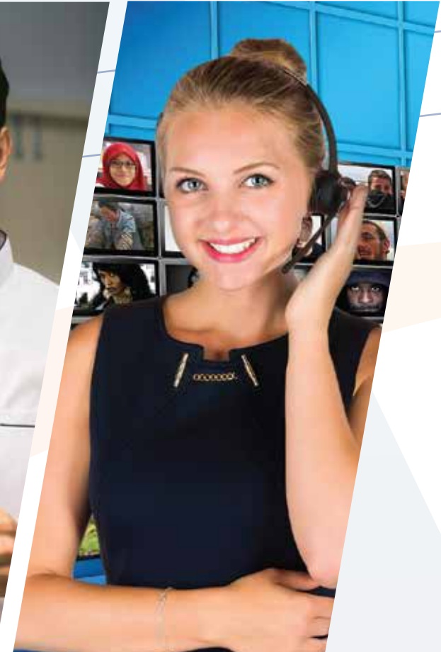
Telecommunication Indus- try